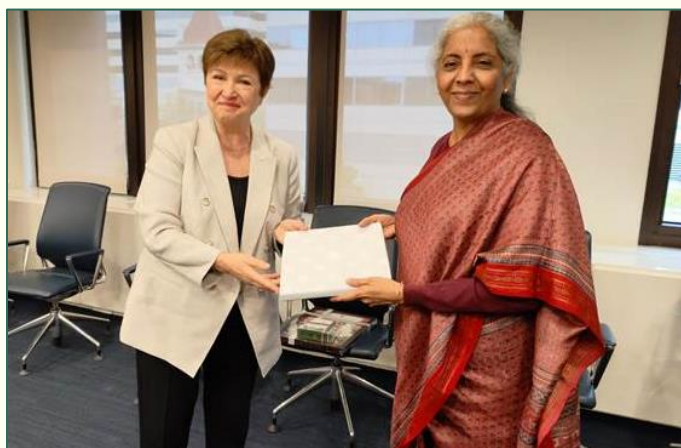
Ms. Kristalina Georgieva & Smt. Nirmala Sitharaman in Washington D.C.